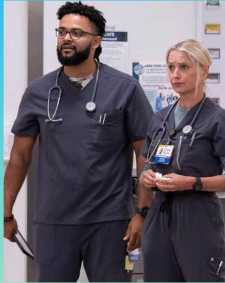
Nurse & Nurse Practitioner