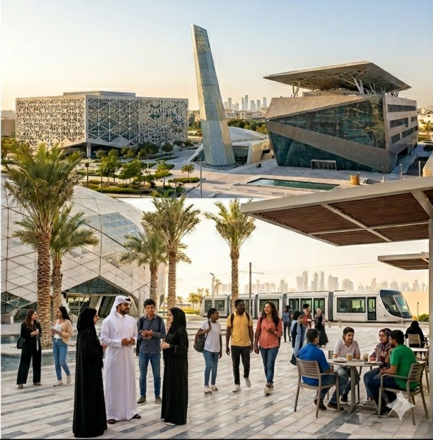
Image created by Google Gemini with prompt: visualize the difference in student life between US campus and a MENA campus