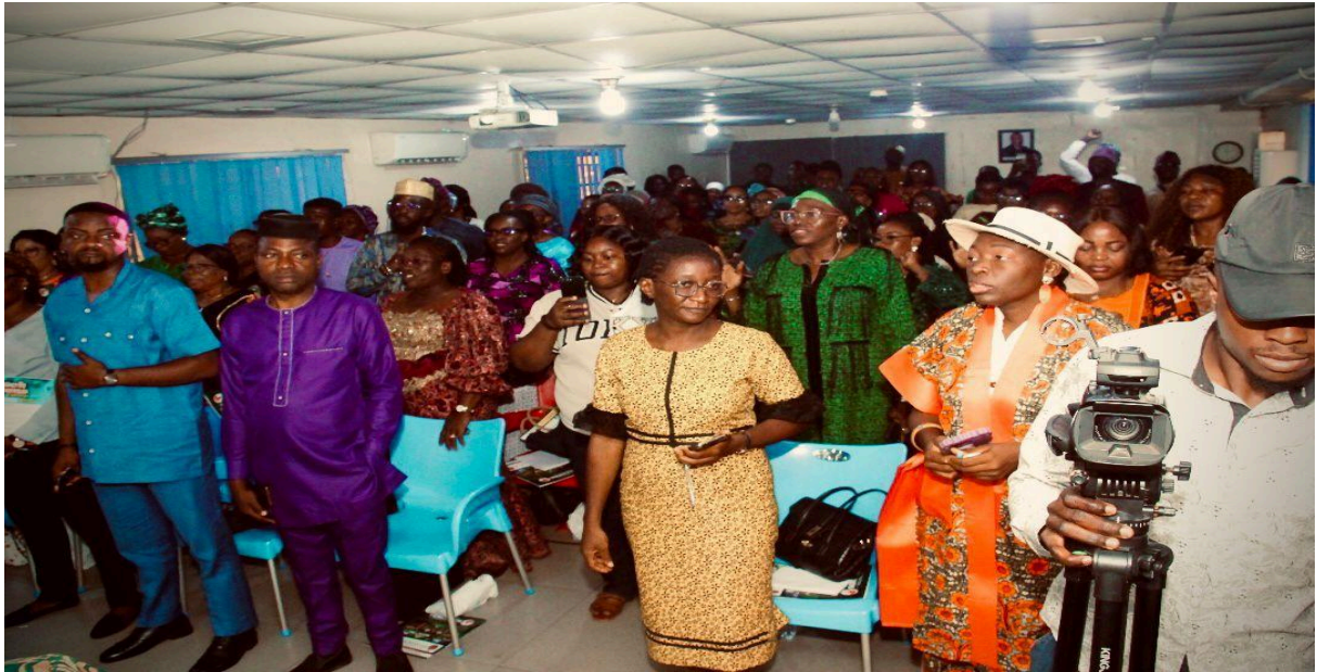
A cross section of the Counsellors Connect audience