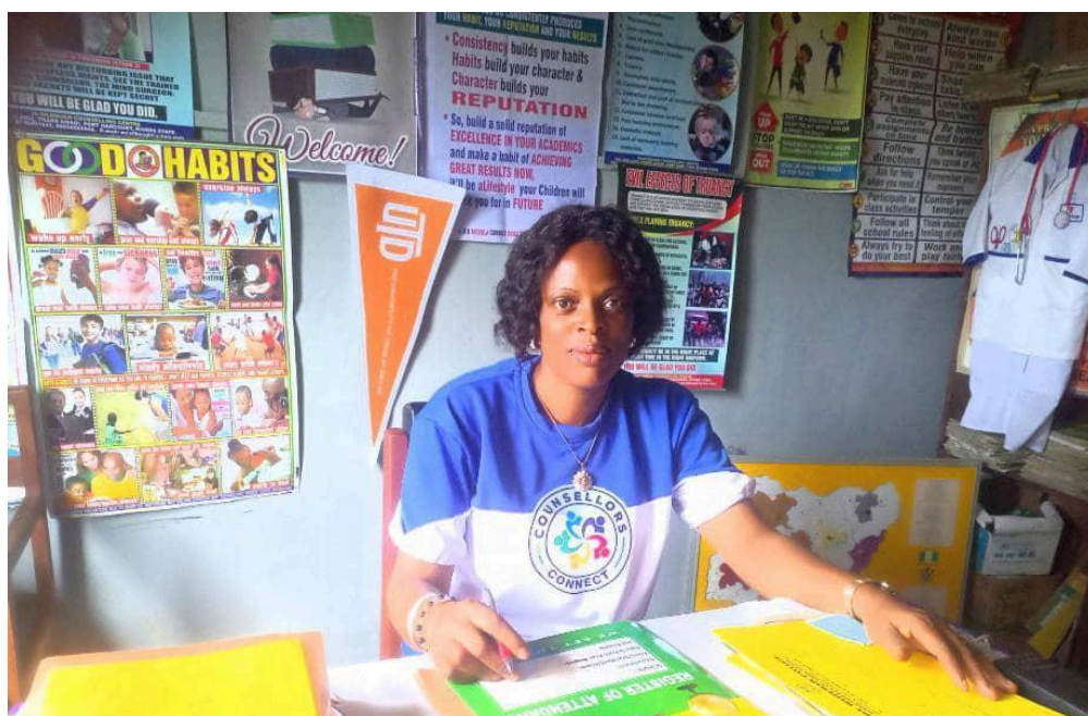
Beneficiary of Counsellors Connect in Nigeria Conference proudly showing up in the office in her branded counsellors' T shirt