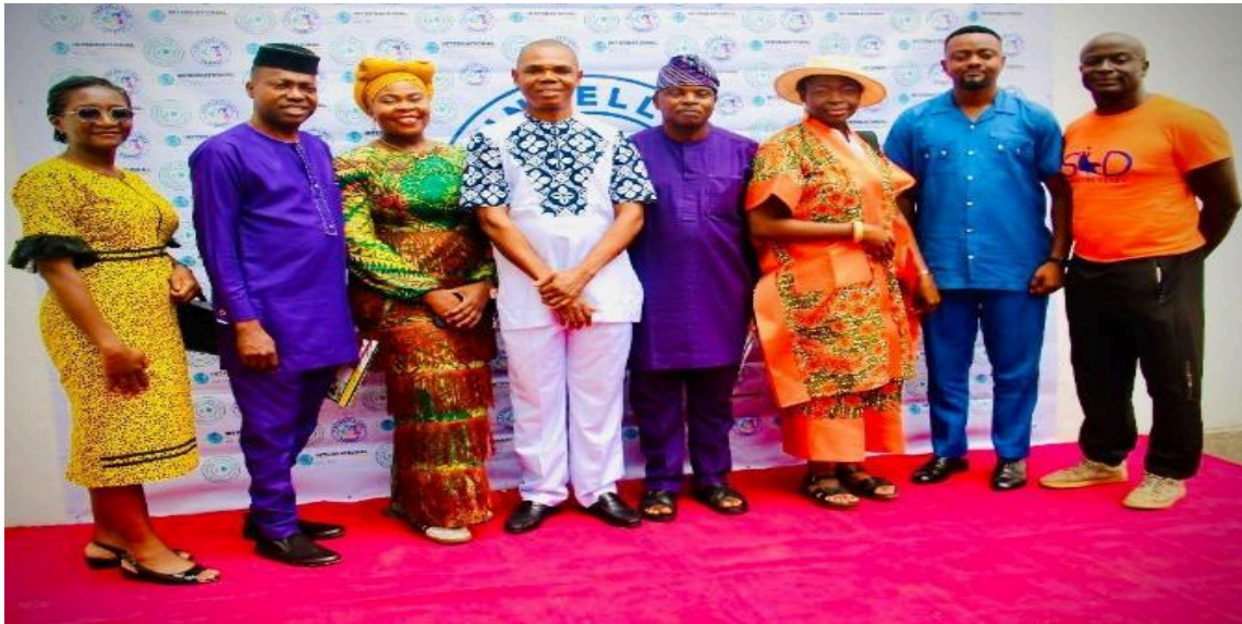
Speakers who presented Physically at the Counsellors Connect Conference