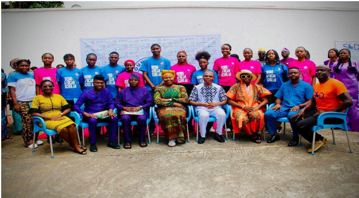
University aspirants in company of Counsellors Connect Speakers