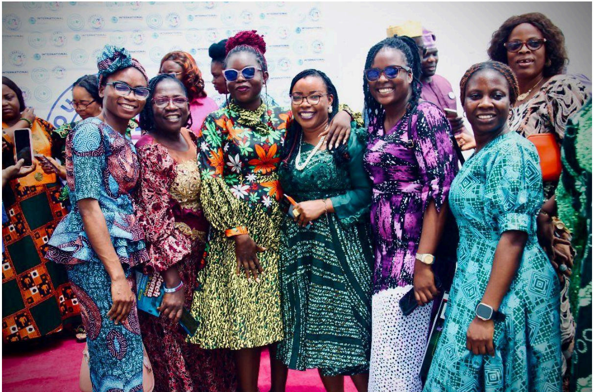
Social capital emerging through friendships born at the Counsellors Connect event in Lagos, Nigeria