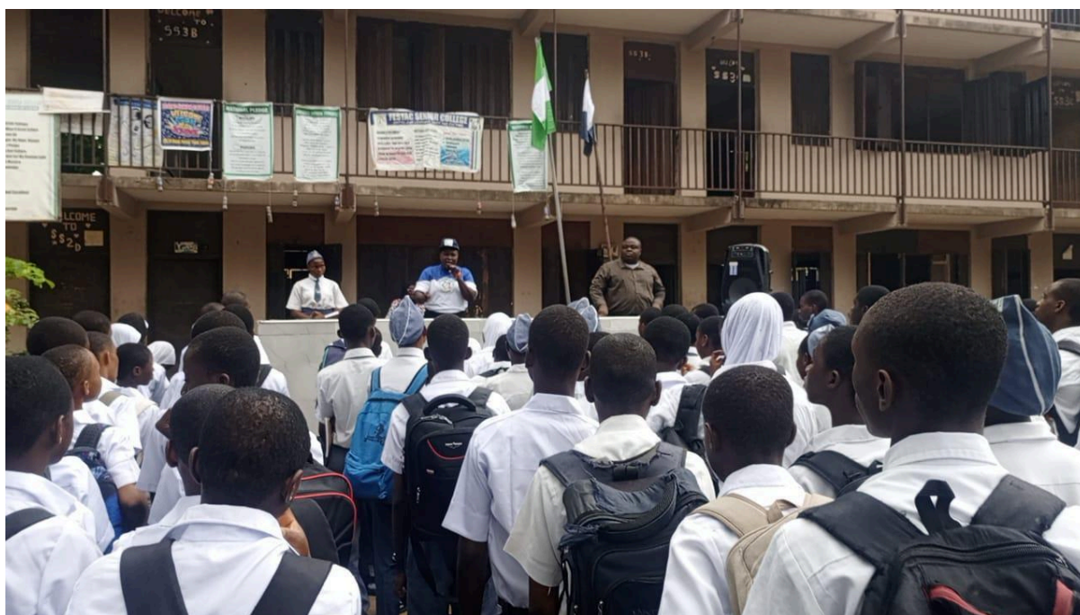
One of the beneficiaries of Counsellors Connect in Nigeria conference promoting counselling services in her school