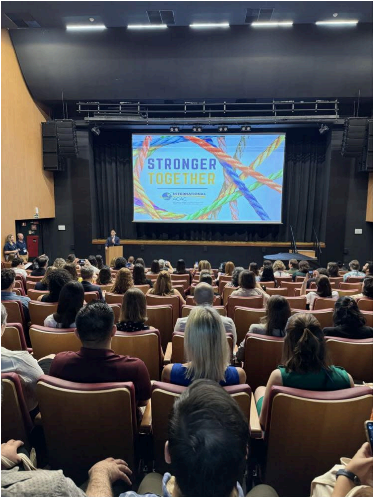
In May, the event was in Prague, Czech Republic at the schools of the Study in Prague Consortium.