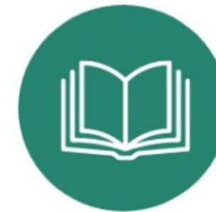
RESEARCH- INTENSIVE (STUDENT-LED RESEARCH)