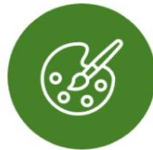
PERFORMANCE AND ARTISTIC PRODUCTION