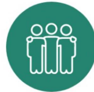
COMMUNITY- ENGAGED LEARNING