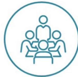
CO-OP / PROFESSIONAL WORK TERM