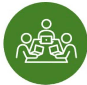
ORGANIZATION PARTNERED PROJECT