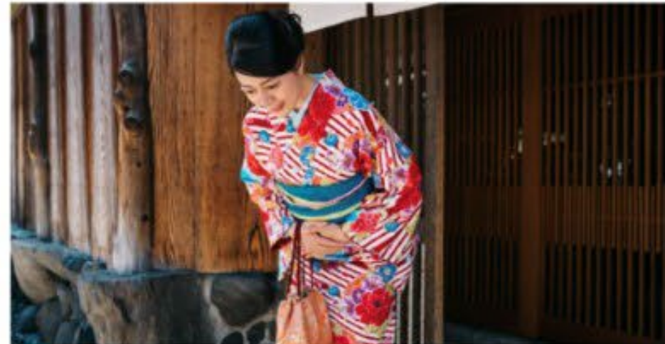
“Omotenashi” (Japanese hospitality)