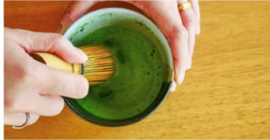
Japanese culture and society