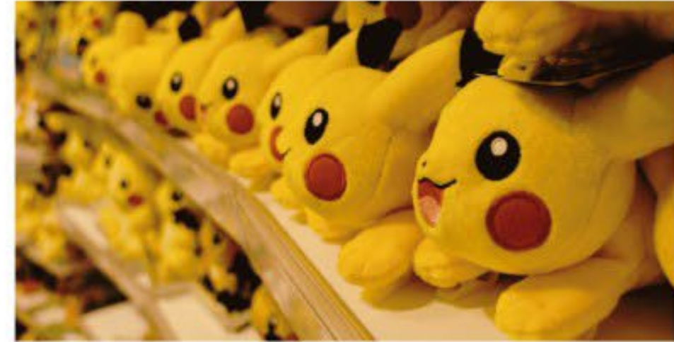
Popular culture & subcultures