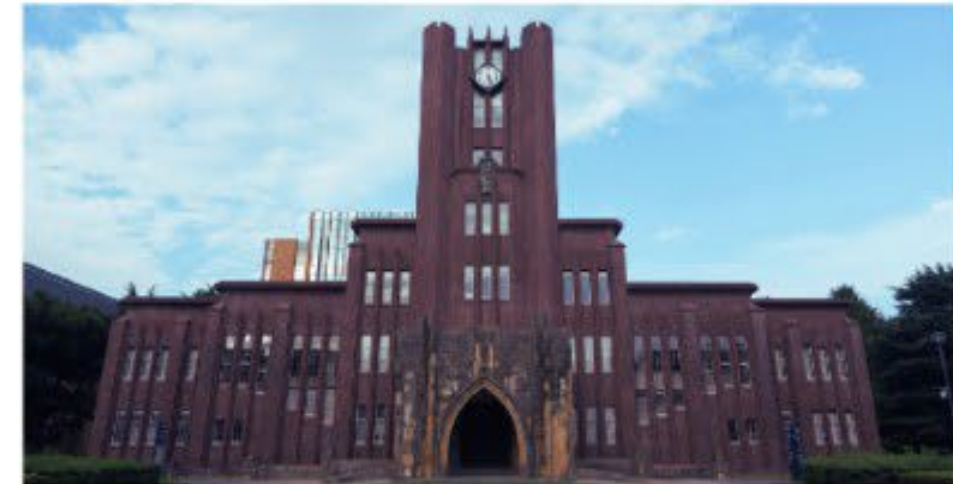
Quality of education & research offered by Japanese universities