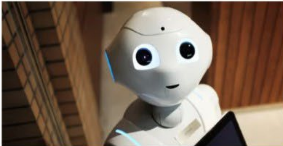
Cutting edge science & technology